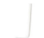
WHITE HOCKEY STICK (EC1002)