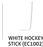
WHITE HOCKEY STICK (EC1002)