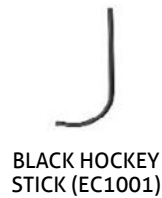
BLACK HOCKEY STICK (EC1001)