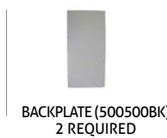
BACKPLATE (500500BK) 2 REQUIRED