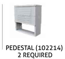
PEDESTAL (102214) 2 REQUIRED