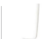
WHITE HOCKEY STICK (EC1002)