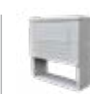
PEDESTAL (102214) 2 REQUIRED