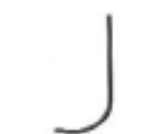
BLACK HOCKEY STICK (EC1001)