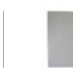
BACKPLATE (750500BK) 2 REQUIRED