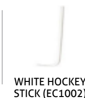
WHITE HOCKEY STICK (EC1002)