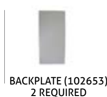
BACKPLATE (102653) 2 REQUIRED