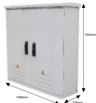
Example: double door kiosk

Door locking mechanism must not be interfered with.