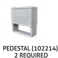
PEDESTAL (102214) 2 REQUIRED