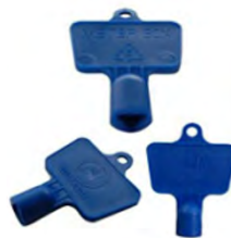
SPARE KEY (170001)