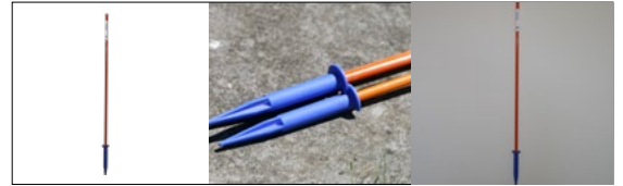
NON-CONDUCTIVE LINE MARKERS 600MM, 750MM, 900MM LINE MARKERS (600MM 102545, 750MM 102456, 900MM 102547)