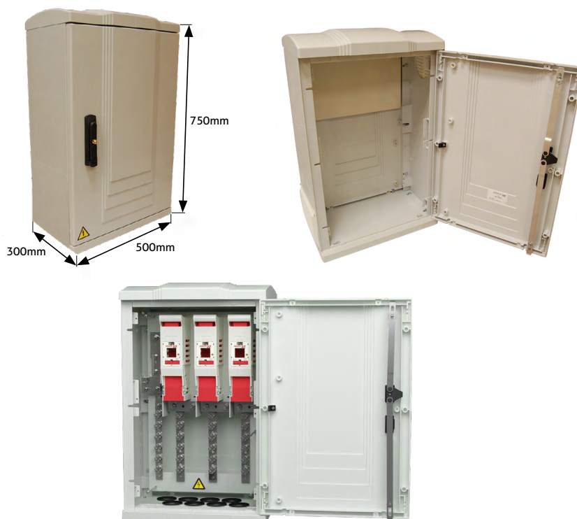
Example: distribution & protection board

Complies with the international standard for empty enclosures as applied to low-voltage switchgear and control gear assemblies (IEC 62208:2011).