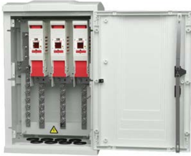
Example: distribution + protection board