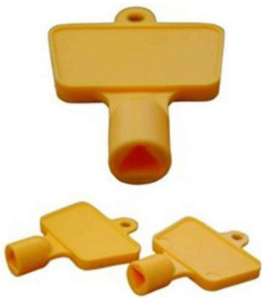
Spare key (170000)