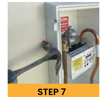
Step 7: Insert supplied wall plugs into the wall.