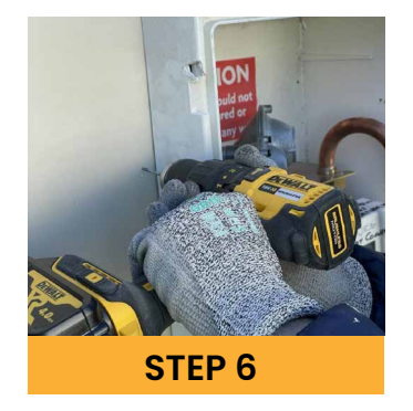
Step 6: Drill holes using M6 Drill bit at a depth of 30mm.